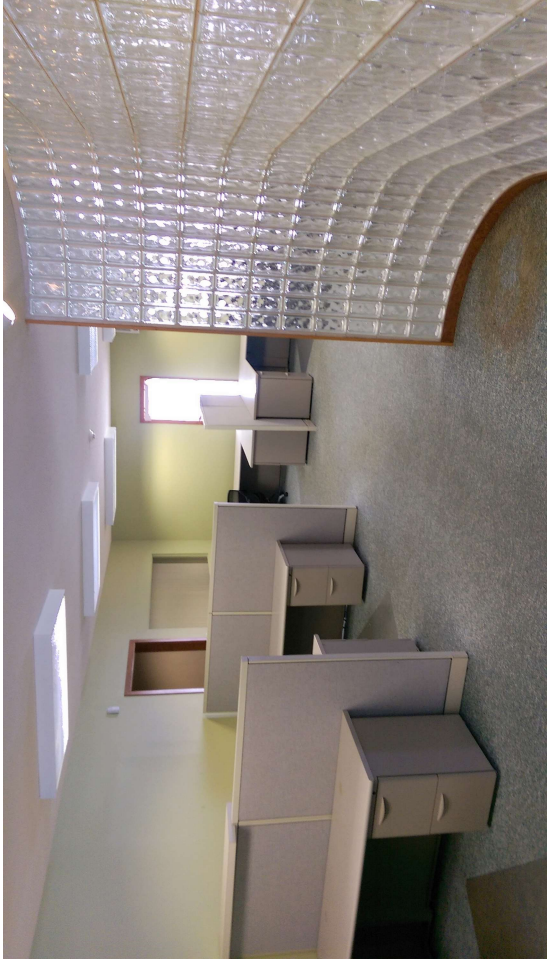
Front Offices, 16 open desk areas with partitions