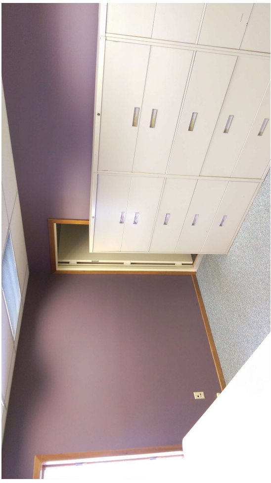
Storage with laterals