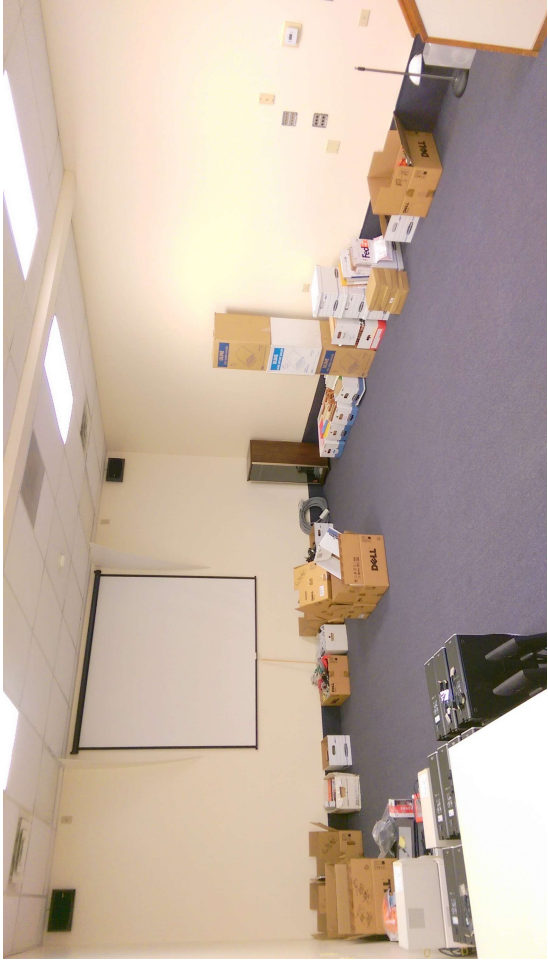
20' x 29' Classroom