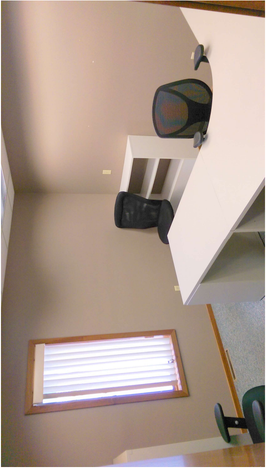
Private Office 4