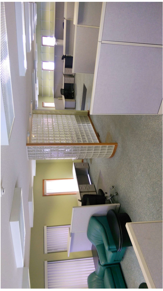
Front Offices, 16 open desk areas with partitions