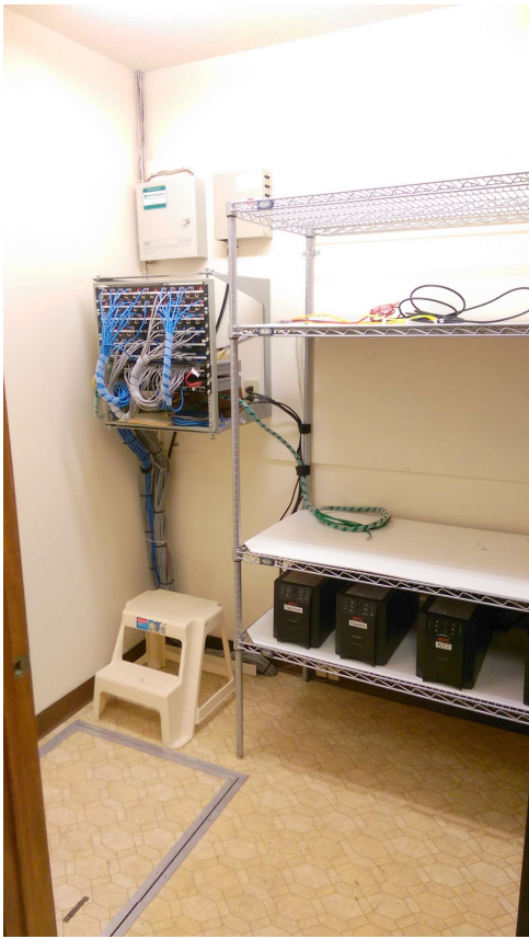
Network & Server Rack, Coax, Fiber, separate open & secure networks