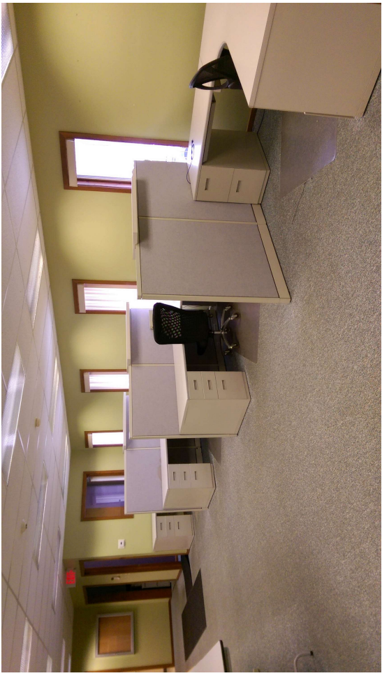
Rear Offices, 4 open desk areas with partitions