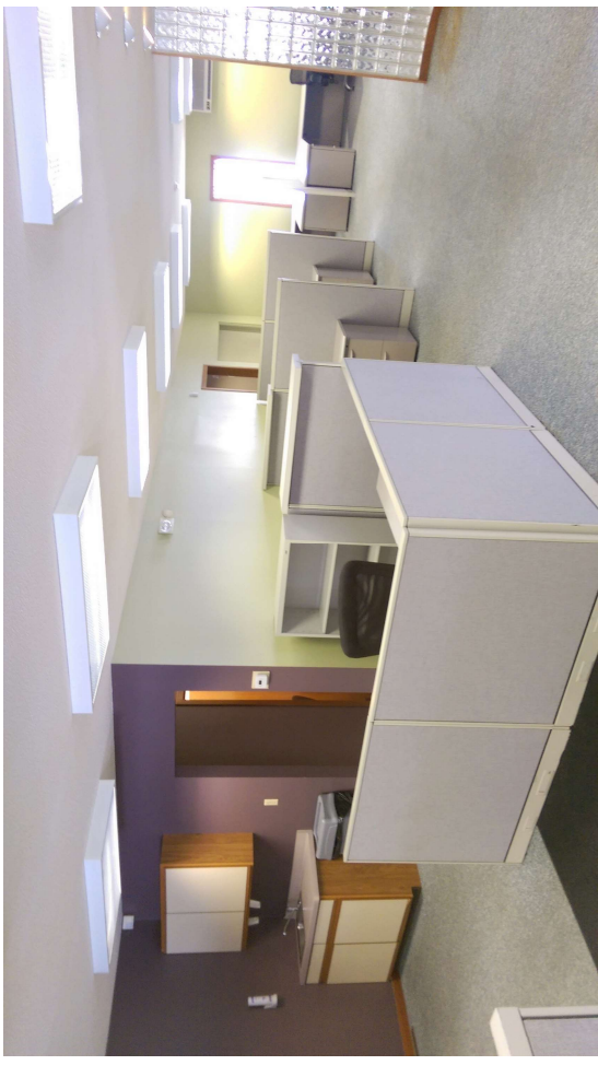
Front Offices, 16 open desk areas with partitions, small kitchen