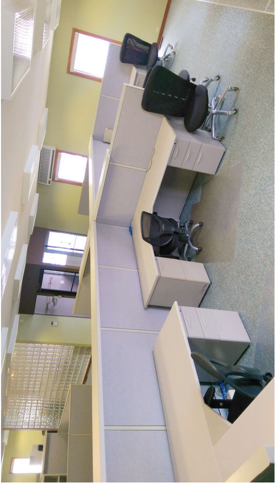
Front Offices, 16 open desk areas with partitions