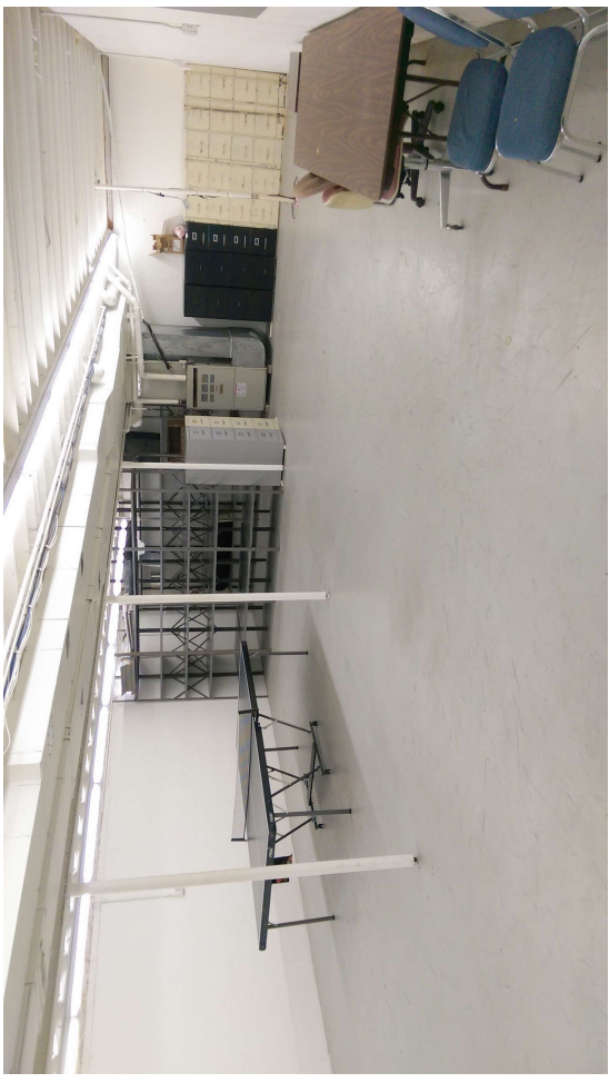
61' x 29' Basement