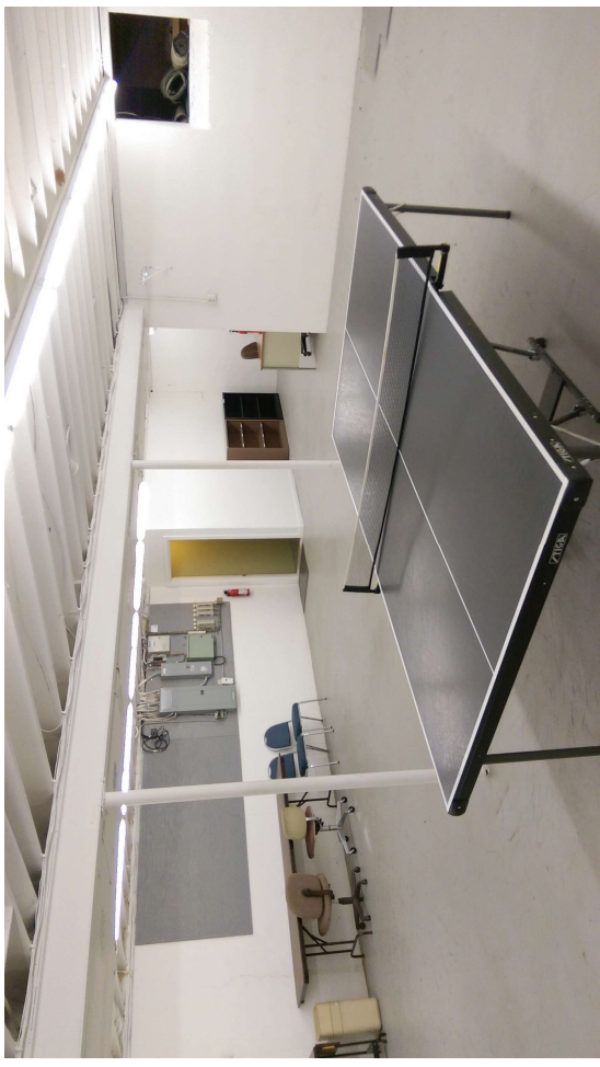
61' x 29' Basement