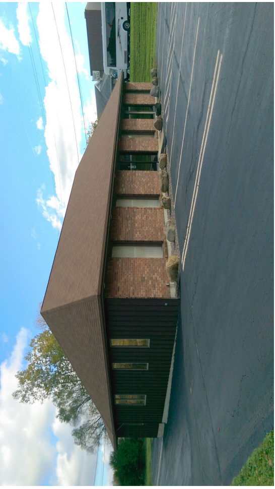
Parking for 24 cars