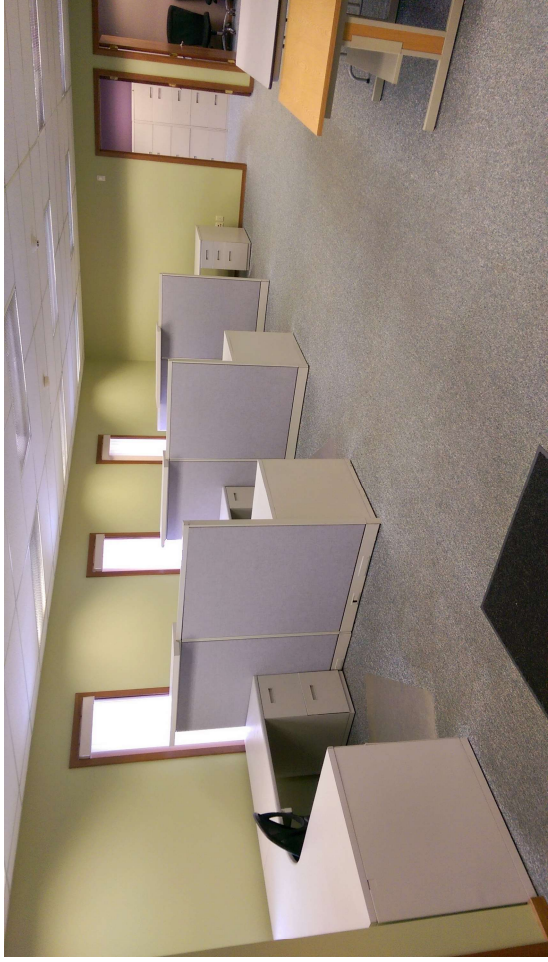
Rear Offices, 4 open desk areas with partitions