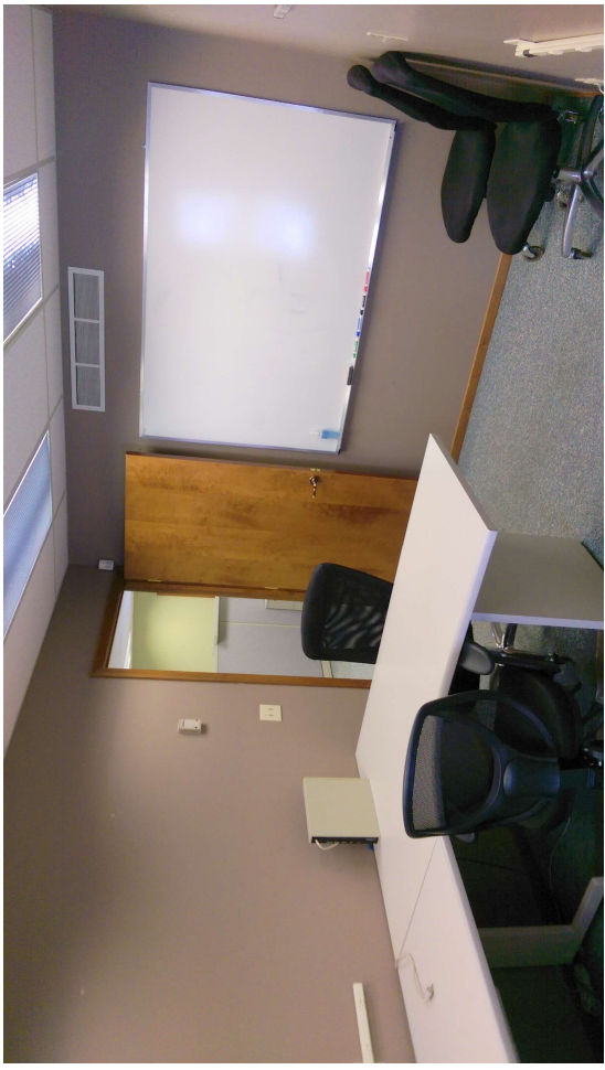
Private Office 1