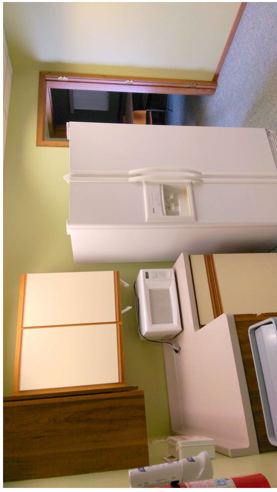
Kitchen with coffee maker, refrigerator & microwave