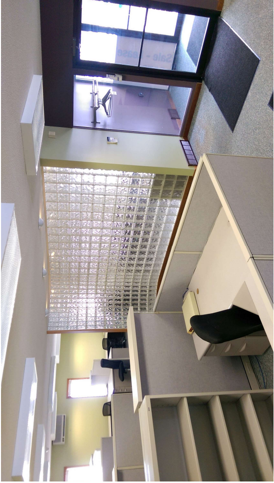
Front Offices, reception desk