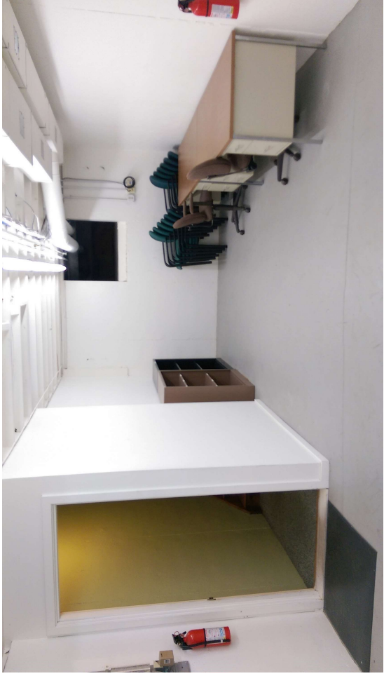
61' x 29' Basement