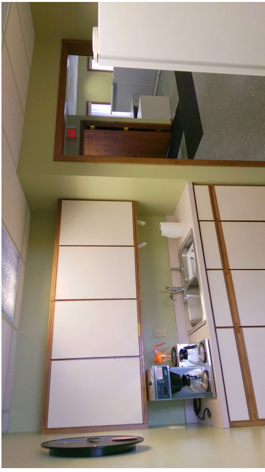
Kitchen with coffee maker, refrigerator & microwave