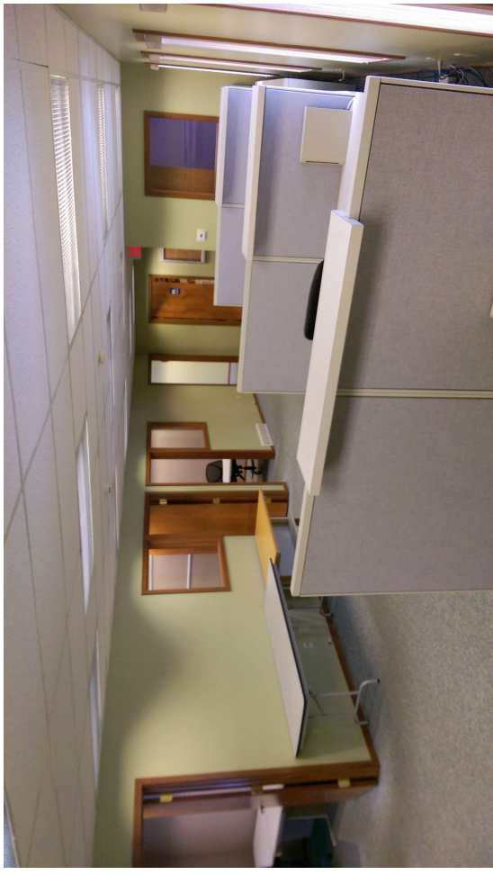
Rear Offices, 4 open desk areas with partitions