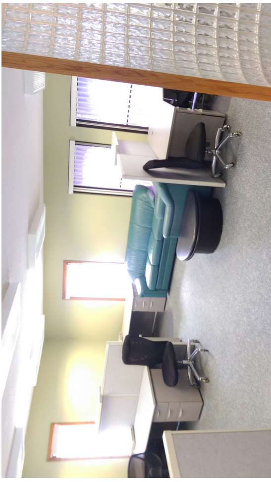
Front Offices, 16 open desk areas with partitions