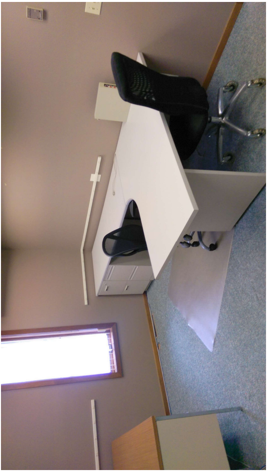
Private Office 1