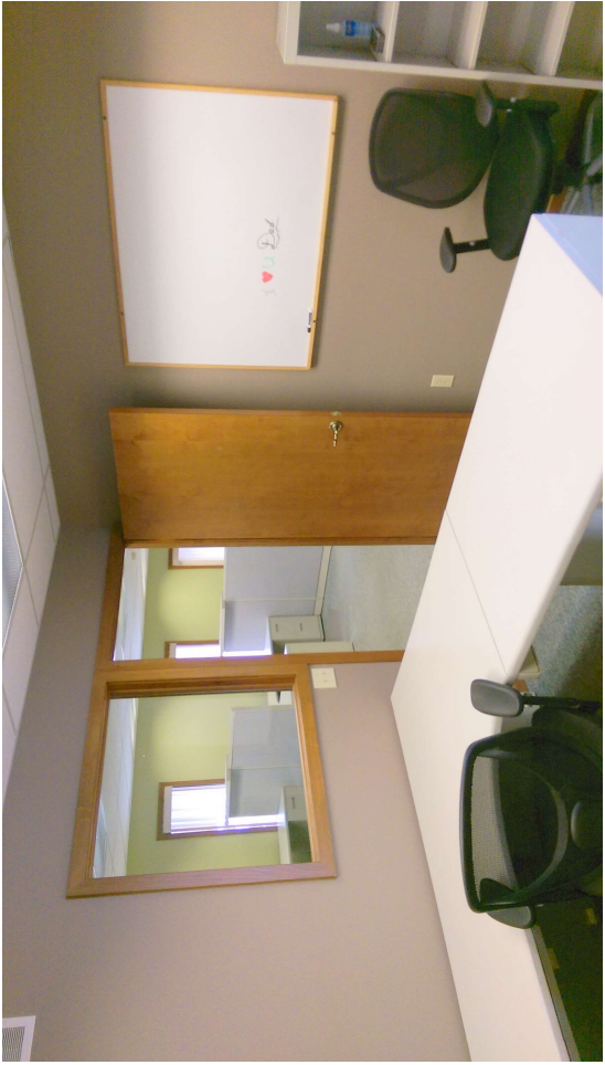
Private Office 4