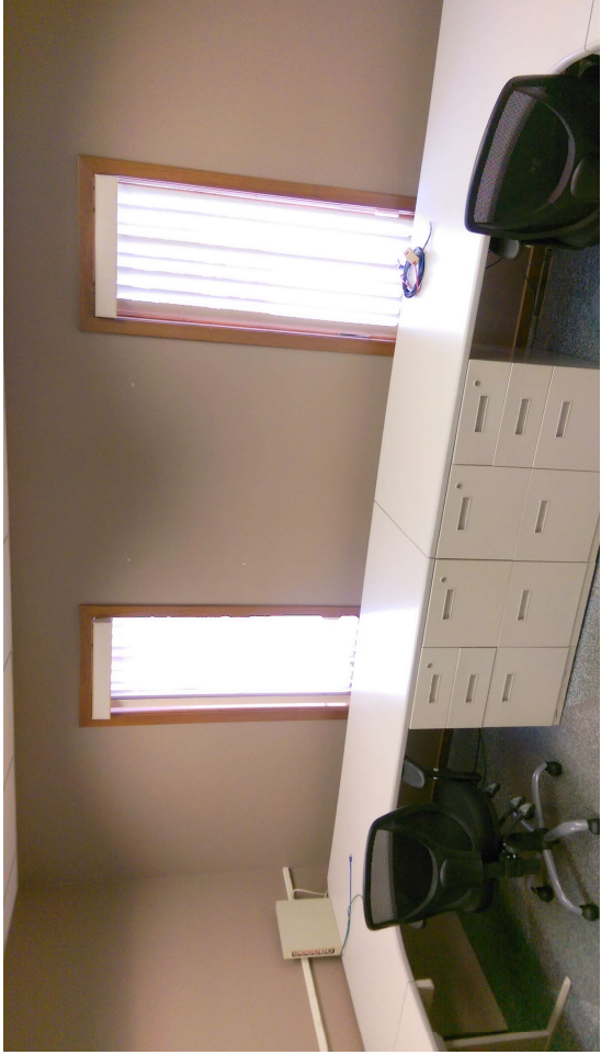
Private Office 2