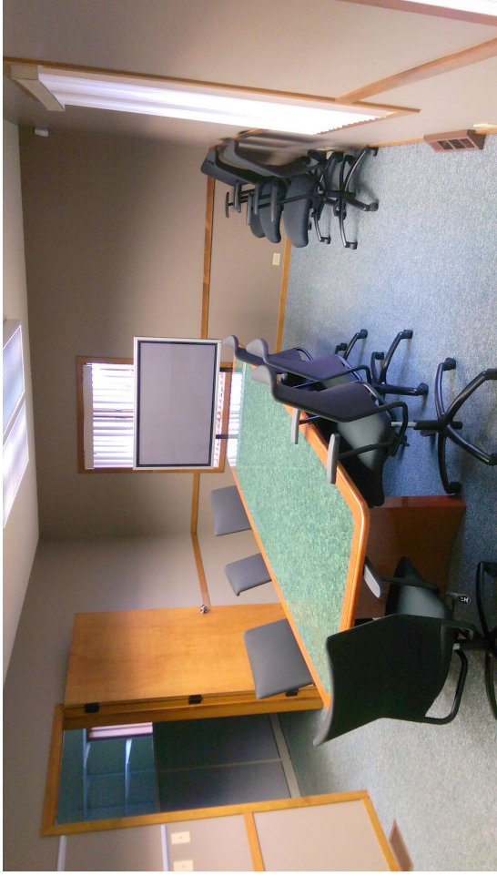
Conference Room, table, chairs, white board & screen