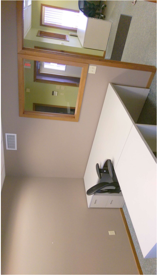
Private Office 4