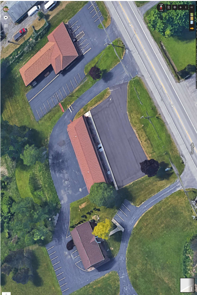
7615, 7625 & 7641 Seneca St Offices Front