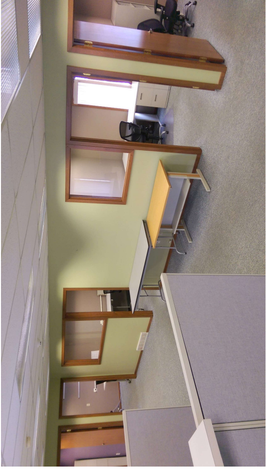
Rear Offices, 4 open desk areas with partitions