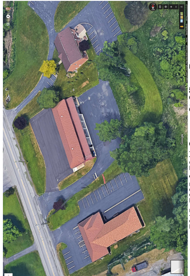
7615, 7625 & 7641 Seneca St Offices Rear