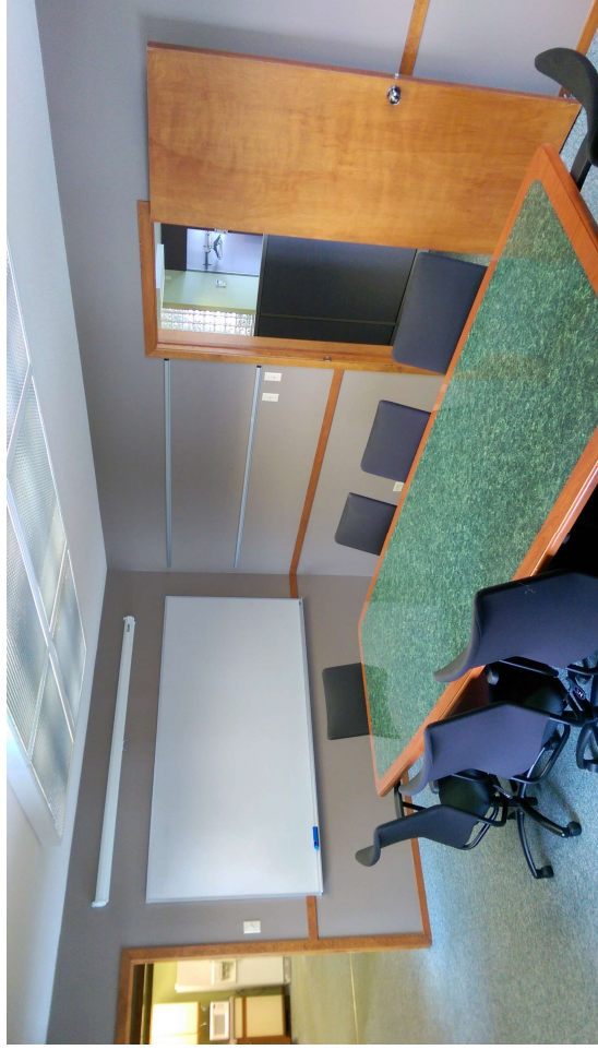
Conference Room, table, chairs, white board & screen