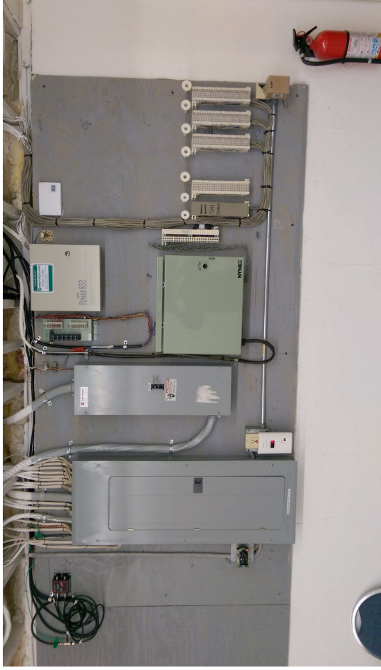
Main Power, split 200 amp service