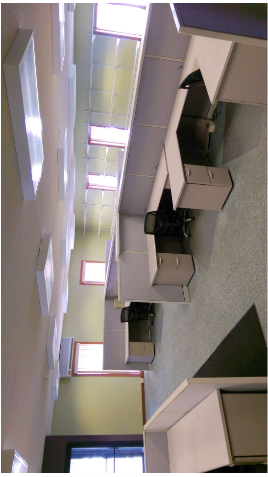
Front Offices, 16 open desk areas with partitions