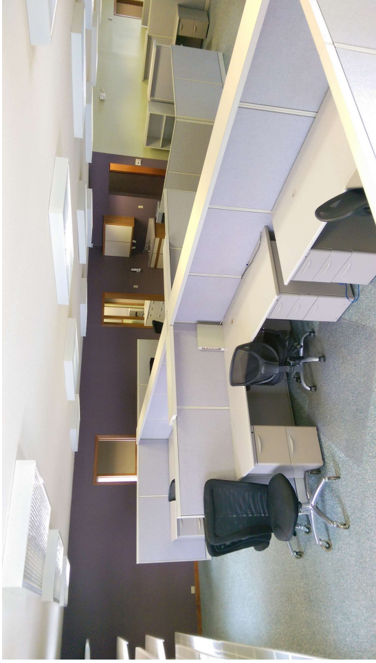
Front Offices, 16 open desk areas with partitions