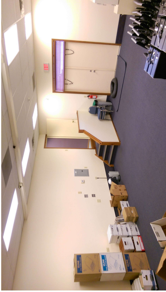
20' x 29' Classroom